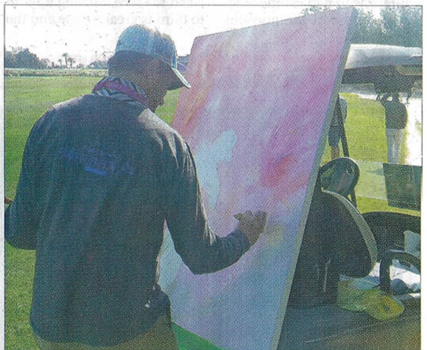
An artist works on a canvas mounted on a golf cart to paint a live picture at the Doha Golf Club during the Commercial Bank Qatar Masters.