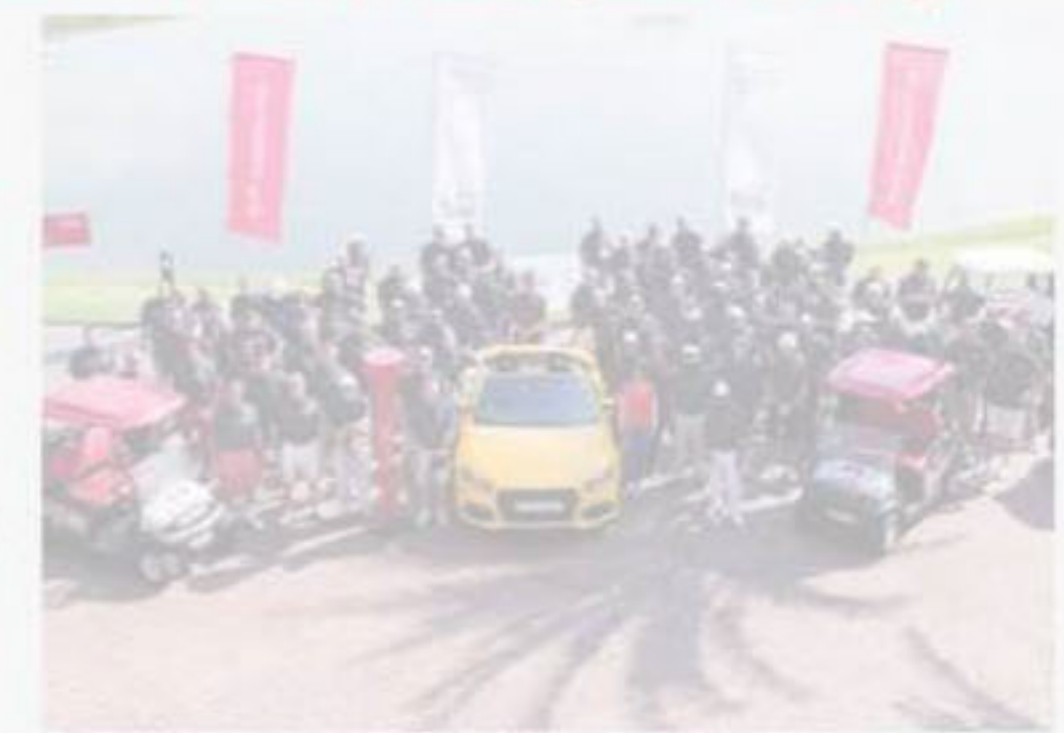
Participants at The Address Montgomerie

The Audi quattro Cup Golf Tournament Series was established in 1991 and is celebrating its 25th anniversary in 2015. Last year, more than 100,000 players took part in 54 countries worldwide.