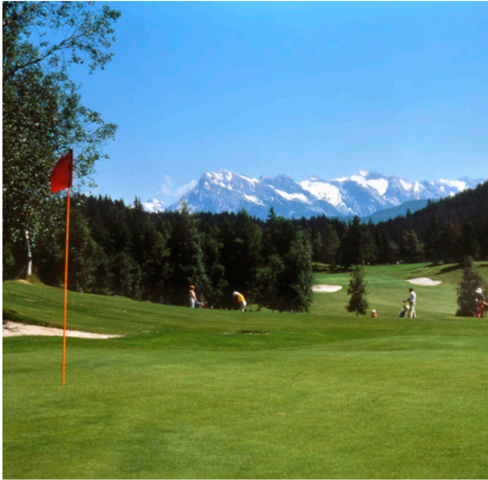
Golfclub Seefeld-Wildmoos, in the heart of the Alps in Austria, was one of Harradine's personal favourites

"It is a blessing that there are no fixed rules for the layout of golf courses, so I can try to find the right solution for every landscape"