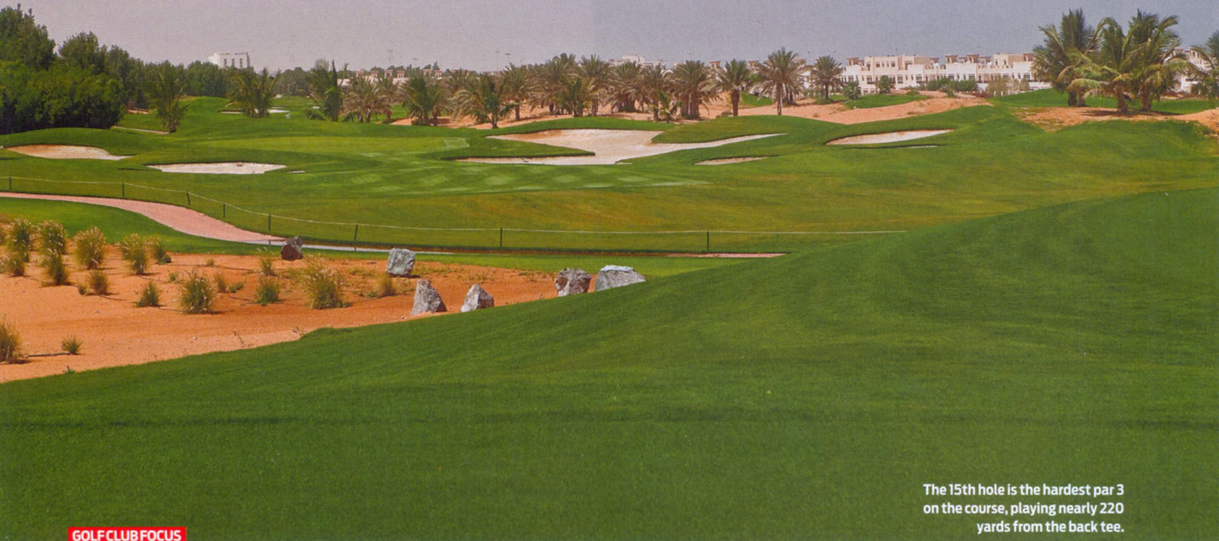
The 15th hole is the hardest par 3 on the course, playing nearly 220 yards from the back tee.