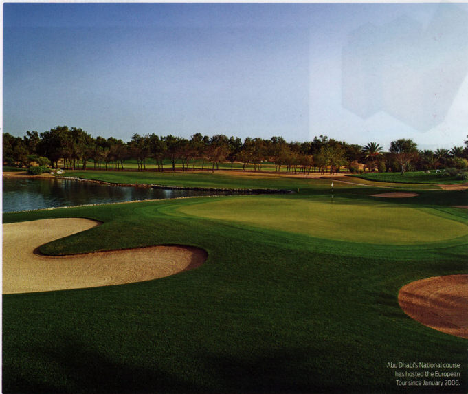
Abu Dhabi's National course has hosted the European Tour since January 2006.